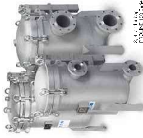
3, 4, and 6 bag PROLINE 150 Series HE multi-bag filter housings

Viton® is a registered trademark of E. I. du Pont de Nemours and company