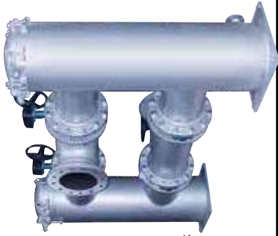
12" Model 950B duplex strainer with quick open cover