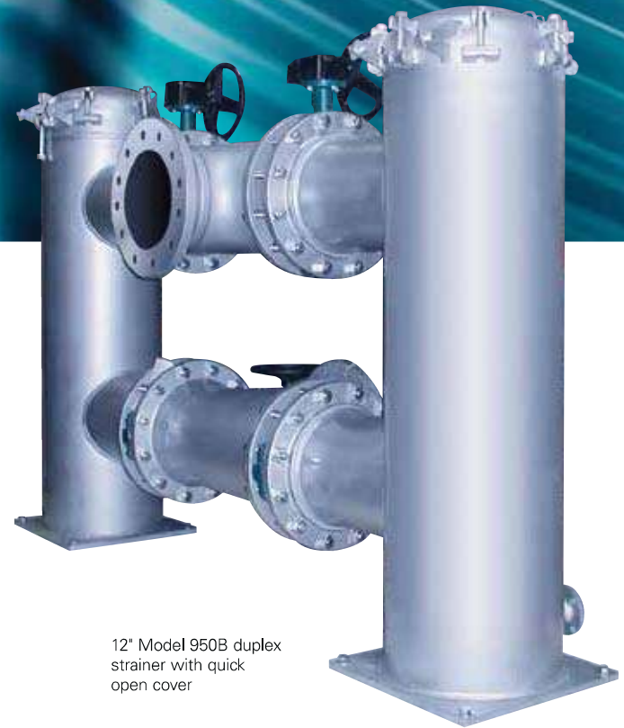
12" Model 950B duplex strainer with quick open cover

For applications with more frequent changing, Eaton offers a hinged, quick opening cover secured by swing bolts. This is adaptable for higher pressure applications. For medium size strainers, 8" to 12," a davit assembly bolted