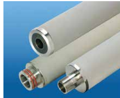
LOFMET filter cartridges are available with a variety of gasket and end cap configurations.

The micron ratings shown at various efficiency and beta ratio value levels were determined through laboratory testing, and can be used as a guide for selecting cartridges and estimating their performance. Under actual field conditions, results may vary somewhat from the values shown due to the variability of filtration parameters. Testing was conducted using the single-pass test method, water at 3 gpm/10" cartridge (9.45 l/min). Contaminants included latex beads, coarse and fine test dust. Removal efficiencies were determined using dual laser source particle counters.