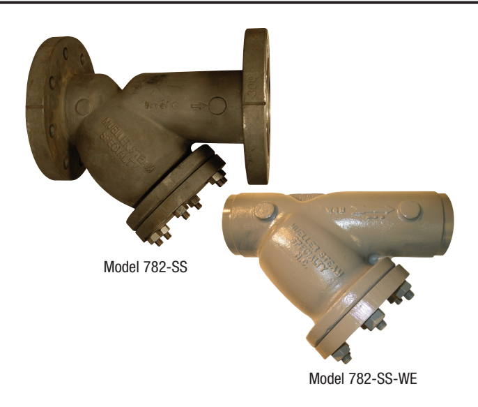
*782/782-WE supersede model 762/762-WE. 762/762-WE still available upon request