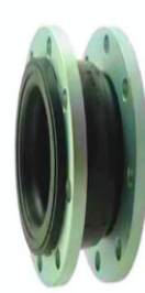
STYLE 100, 101 橡胶接头 (36)

Flanges drilling: Available ANSI B 16.5, DIN 2501, JIS B 2210, BS 4504, AS 2129, ISO 7005, etc. and welcome other standard drilling for your specifications.