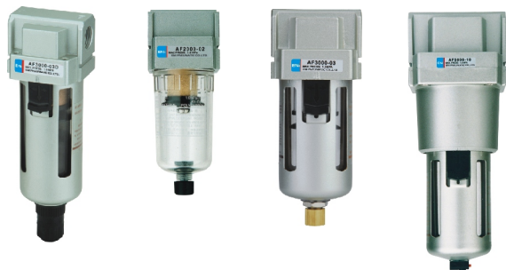
AF3000-03D AF2000-02 AF3000-03A AF5000-10